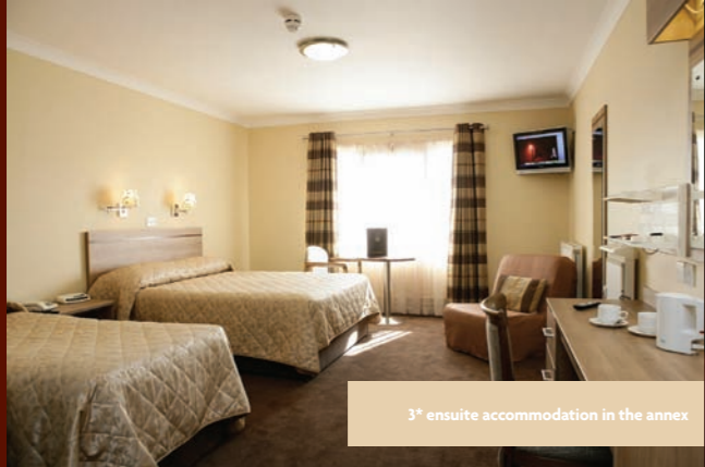
3* ensuite accommodation in the annex