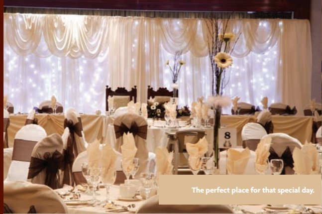
The perfect place for that special day.