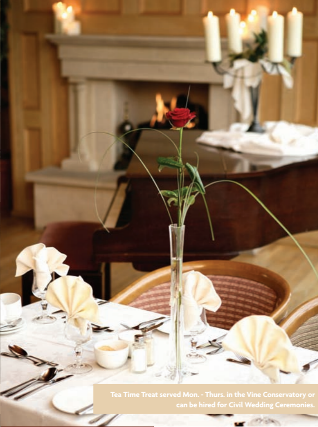
Tea Time Treat served Mon. - Thurs. in the Vine Conservatory or can be hired for Civil Wedding Ceremonies.