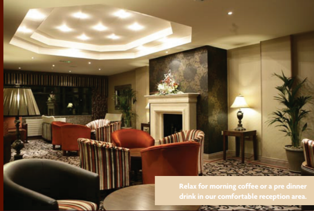
Relax for morning coffee or a pre dinner drink in our comfortable reception area.